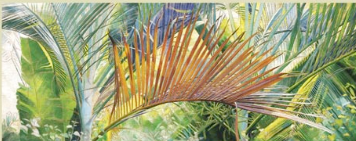
Nature Symphony with Light, Blues and the Wisdom of Fall