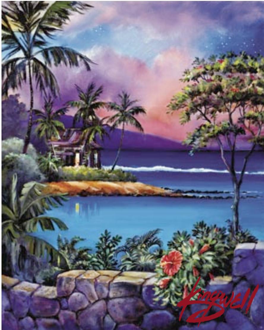
"Morning's First Light" Oil, 22" x 16"