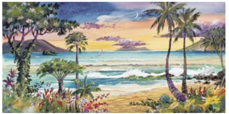
"Wailea Moon" Watercolor, 10" x 20"